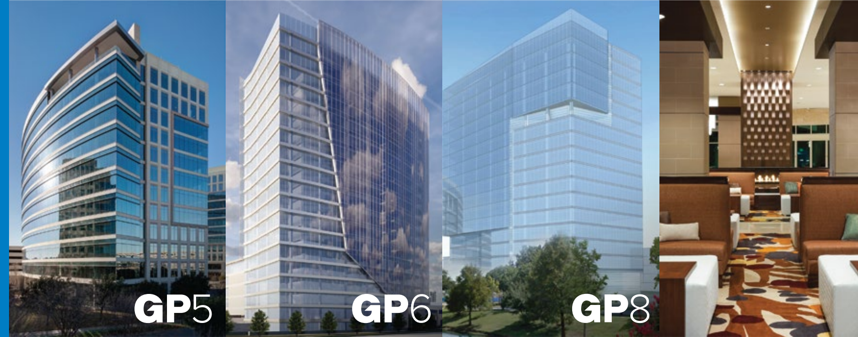
Granite Park 5 305,369 SF