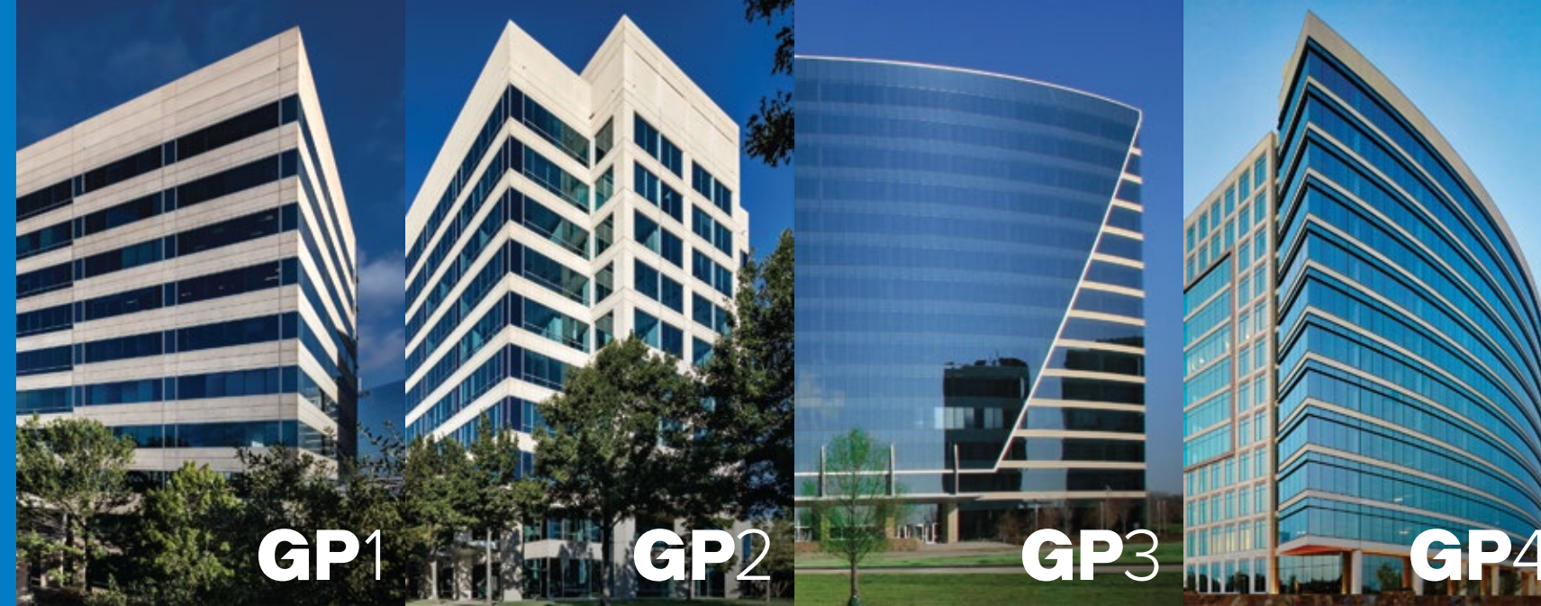
Granite Park 1 256,115 SF